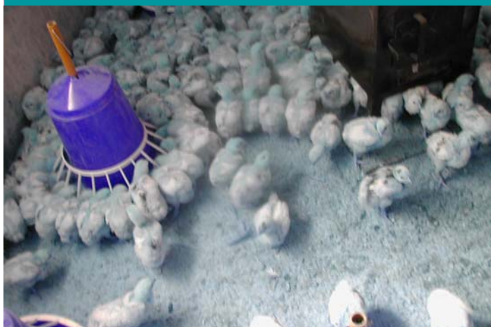
Organized poultry is starting to bring in income for the Gagphey and Zizi village

sanitation and hygiene in two of the most backward villages in Phobjikha. This has facilitated improvement of general sanitation in these areas particularly in terms of waste disposal and management. At the same time, awareness level of these communities has been raised to a large extent. They are now in a better position to understand and tackle the issues relating to sanitation and hygiene. The project has been able to bring tangible benefit to the local communities and at the same time influence positively on other projects like Ecotourism.