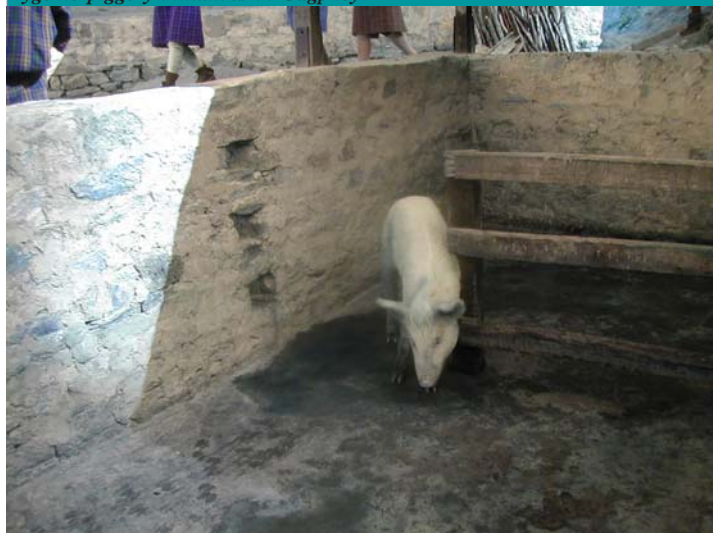
Hygienic piggery initiatives in Gagphey

sanitation and hygiene in two of the most backward villages in Phobjikha. This has facilitated improvement of general sanitation in these areas particularly in terms of waste disposal and management. At the same time, awareness level of these communities has been raised to a large extent. They are now in a better position to understand and tackle the issues relating to sanitation and hygiene. The project has been able to bring tangible benefit to the local communities and at the same time influence positively on other projects like Ecotourism.