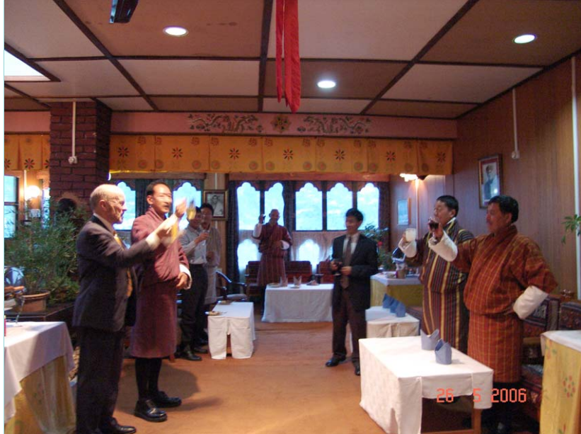
The launching toast for the fund

CEPF (Critical Ecosystem Partnership Fund), is a joint initiative of Conservation International, the Global Environment Facility, the Government of Japan, the John D. and Catherine T. MacArthur Foundation and the World Bank. CEPF strategically targets priority areas while focusing on select hotspots in the developing world. The CEPF profile for the Eastern Himalayas hotspot encompassing Bhutan, northeastern India and Nepal was launched in Bhutan on the 26 th May with participation including senior government and CEPF officials as well as NGOs and civil society representatives.